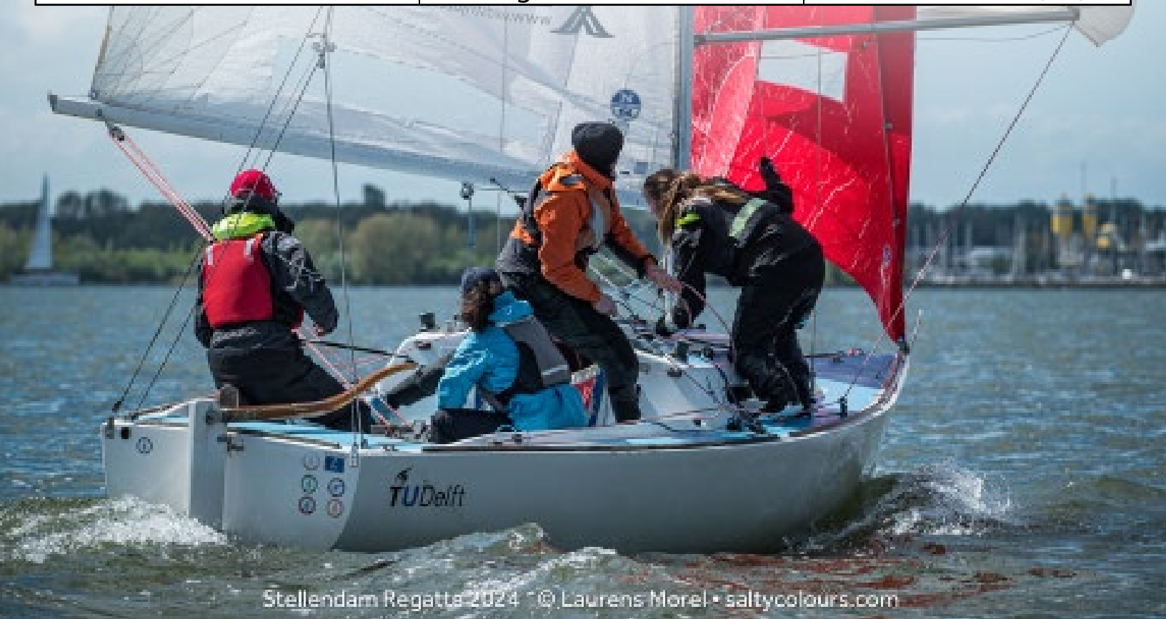
Stellendam Regatta 2024