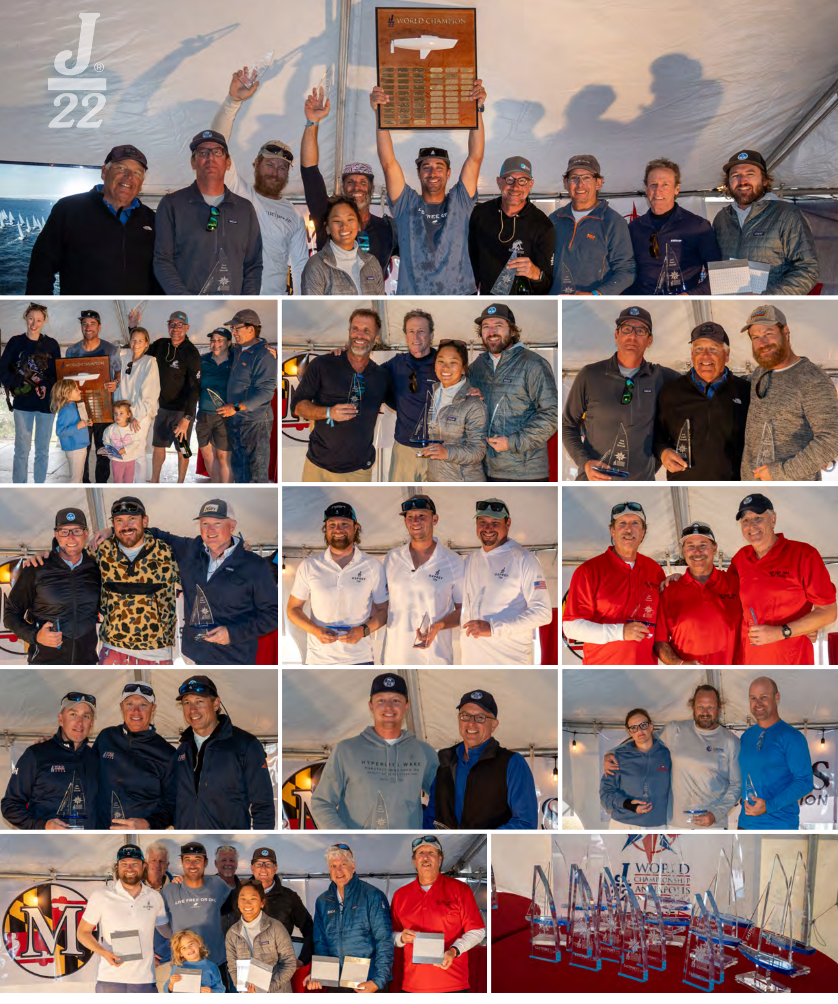
Videos and photos are available on the International J/22 Class Facebook page, and complete event details may be found at https://www.yachtscoring.com/emenu.cfm?eID=16531.